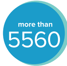
NUMBER OF MEALS SHARED