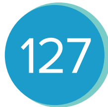
NUMBER OF FAMILIES SERVED IN ANY CAPACITY