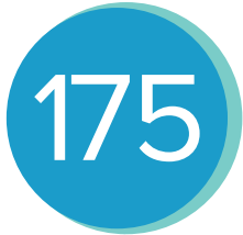
NUMBER OF CHILDREN SERVED IN ANY PROGRAM