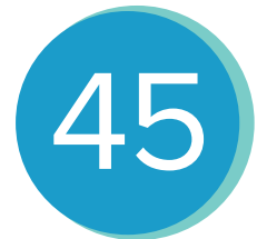
NUMBER OF PEOPLE RECEIVING FINANCIAL ASSISTANCE (COVID-19 RELIEF)