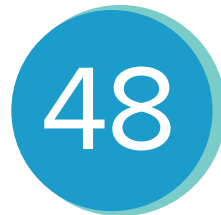
WOMEN & TEENS WHO SUCCESSFULLY COMPLETED FROM WELL FAMILY LEARNING PROGRAMS