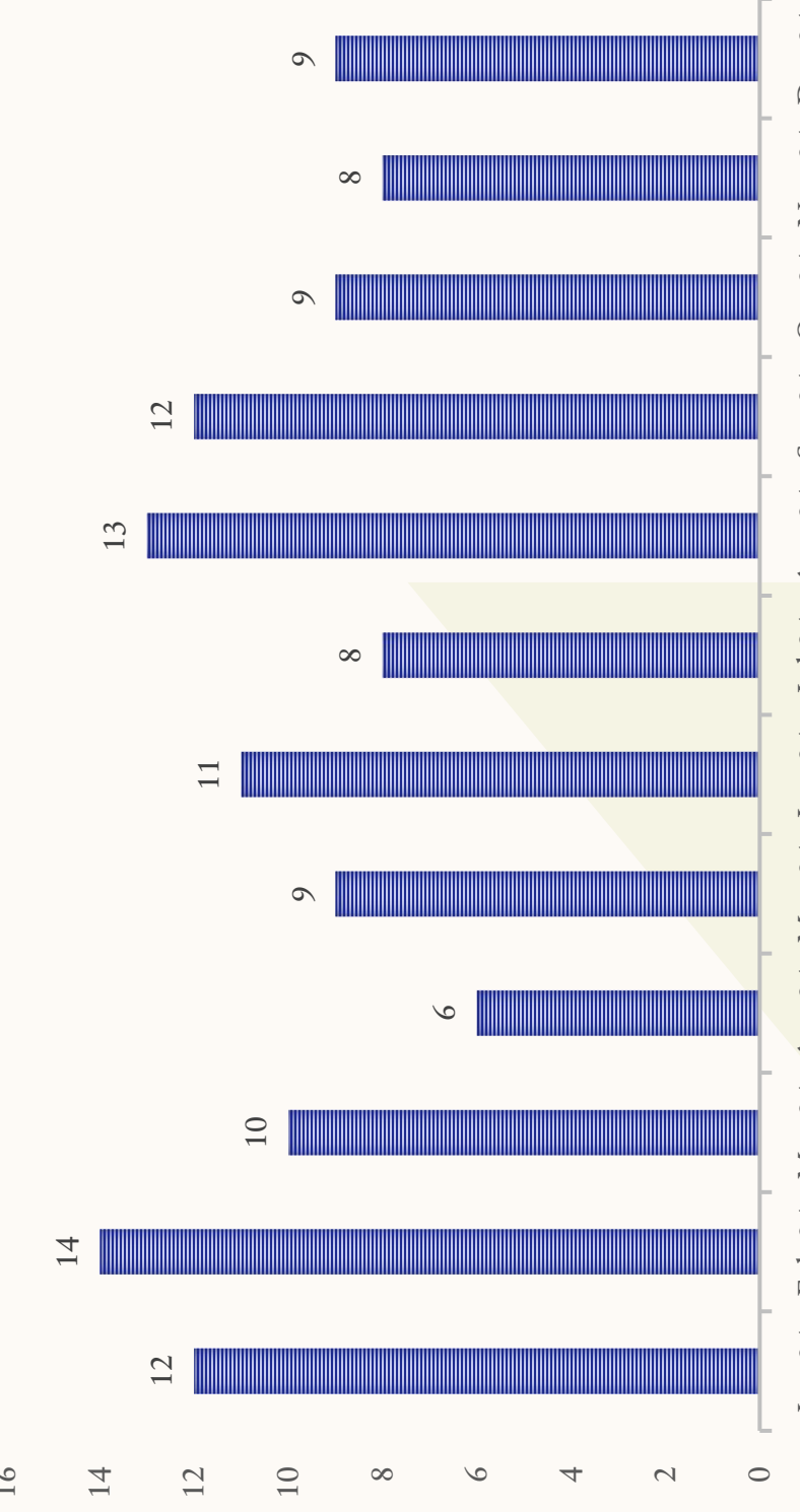
Jan-24 Feb-24 Mar-24 Apr-24 May-24 Jun-24 Jul-24 Aug-24 Sep-24 Oct-24 Nov-24 Dec-24