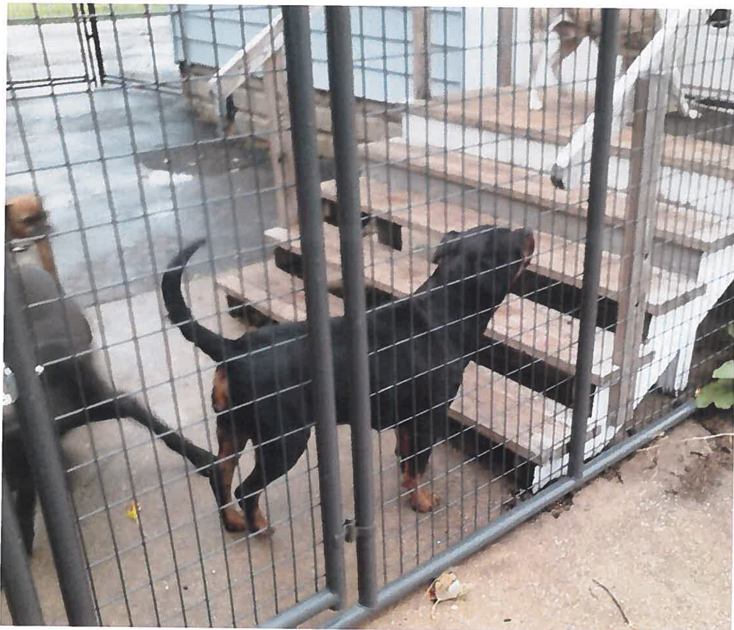
These are pictures of me and my landlords dogs in the play area.