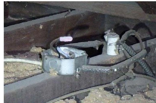
#10 Knob & tube wiring in the attic.