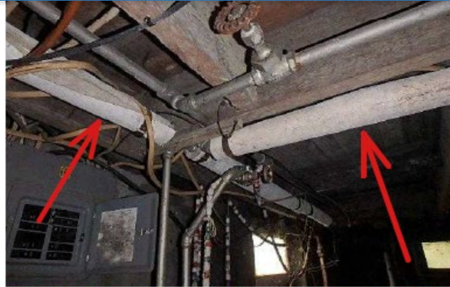
#7 Asbestos pipe insulation, removal advised.

Note: we will strive to rehab homes, but some need to be demolished and are unsafe/unhealthy