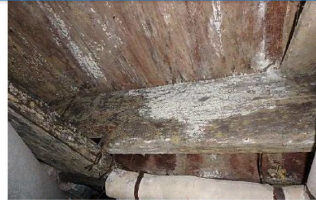
#8 Very heavy mold in the basement and crawlspace, remediation is needed.